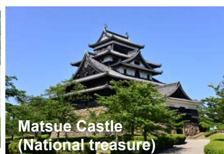
Matsue Castle (National treasure)

The finest Japanese garden selected by "The New York Times"