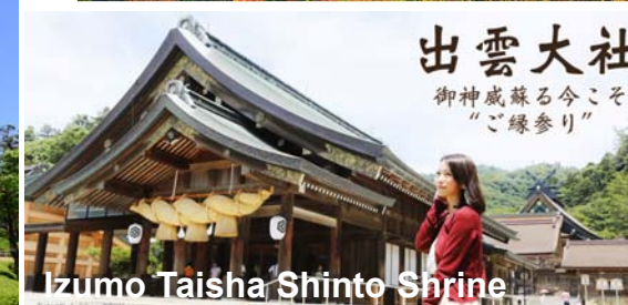
Izumo Taisha Shinto Shrine

Web site shall be open at April 1st 2018.